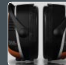
Super-seal comfort ear muff