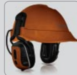
SM1x Helmet mount