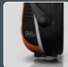
Two-way radio interface connector