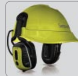
SM1 Helmet mount