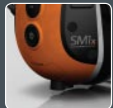
Aux input with protector cover