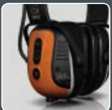
High-Visibility safety colours