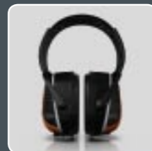
Ruggedised for tough treatment