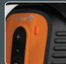
Battery charge LED indicator